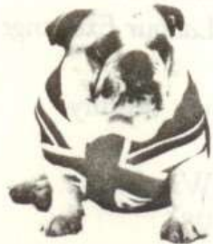
"Hip hip hooray"