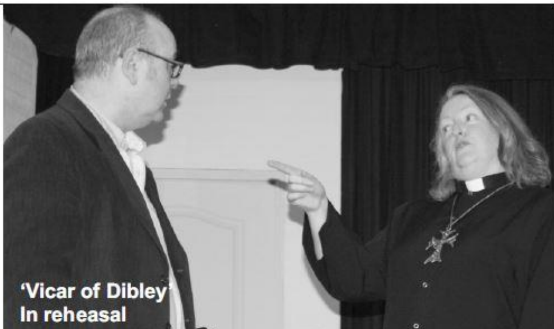
'Vicar of Dibley' In rehearsal