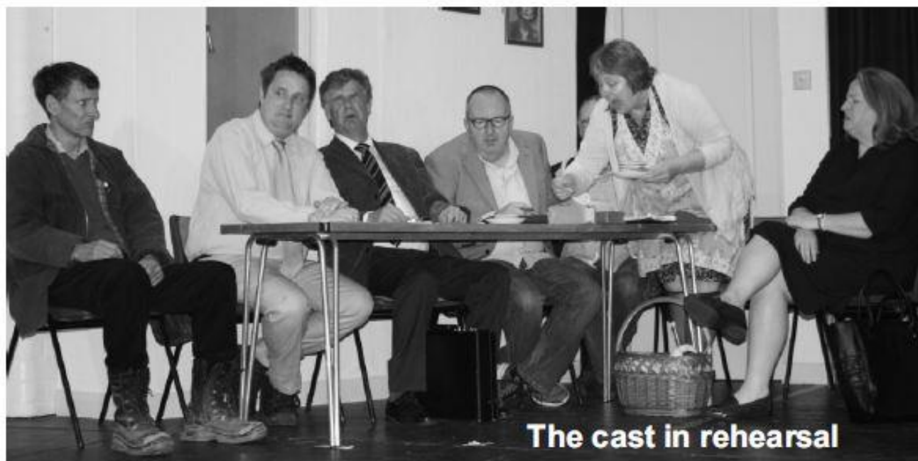
The cast in rehearsal

The names of those who help with ushering, raffle ticket sales, donation of raffle prizes, bar and refreshment personnel are not always known before this programme goes to print, but without their support, the evening for you in the audience would be a lesser one, so we pay tribute to them all and express our grateful appreciation.