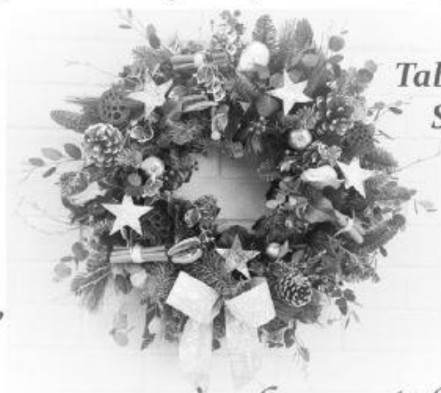
Table Arrangements Special Occasions Funerals Gifts Flower Care Free Delivery in Winchester area

Bouquets Christmas Mother's Day Valentine 'Thank you' Birthdays 'Get Well Soon'